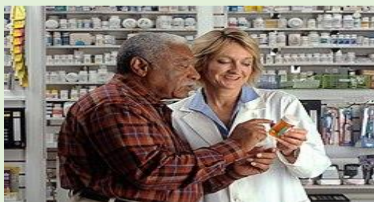
A man consulting with a pharmacist.....